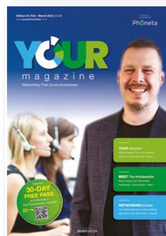
Available in print, or a digital format